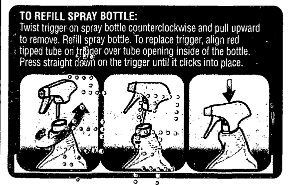
Twist off, Befill . Align Tip to Tabe Push, Snap to Close