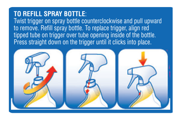
Twist off. Refill Align Tip to Tube Push. Snap to Close