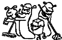
(Optional marketing graphic)