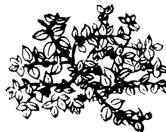
MOUSE-EAR & COMMON CHICKWEED