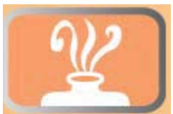
Mild citrus scent