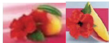
mango and hibiscus