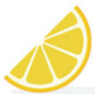
Lemon – Lemon fresh (citrus)