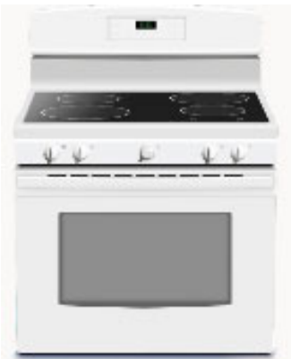
[Stove Glass Top]