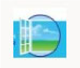
[Open Window Fresh Logo]

[Bracketed text] is optional; text in {braces} is informational to the reviewer.