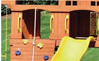
[Before and after]