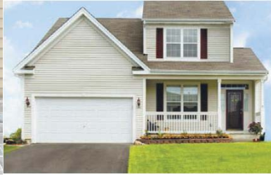
[Indoor & Outdoor]