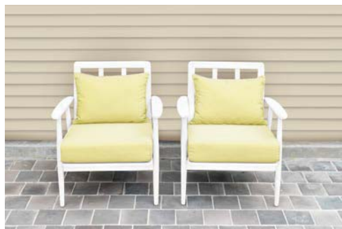
[Outdoor patio furniture]