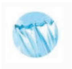
[Linen & Sky Logo]