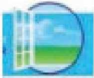
[Open Window Fresh Logo]

[Bracketed text] is optional; text in {braces} is informational to the reviewer.