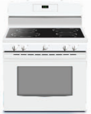
[Stove Glass Top]

[Bracketed text] is optional; text in {braces} is informational to the reviewer.