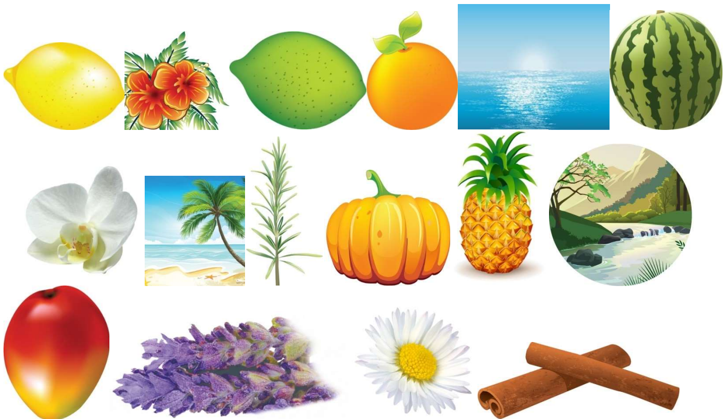
{Optional Pictograms- Usage and Use Sites/Surfaces or Fragrance Descriptors}