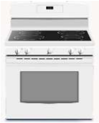
[Stove Glass Top 11 ]

[Bracketed text] is optional; text in {braces} is informational to the reviewer.