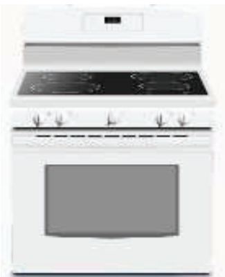
[Stove Glass Top]