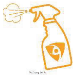
[MB Spray Bottle]