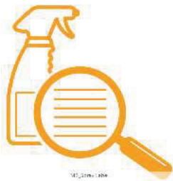
[MB Spray Label]