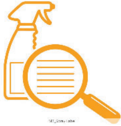
[MB Spray Label]