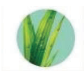
[Morning Dew Logo]