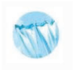
[Linen & Sky Logo]