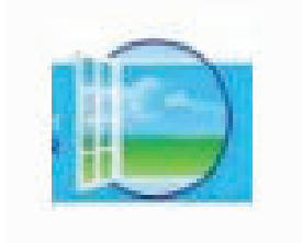
[Open Window Fresh Logo]