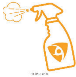
[MB Spray Bottle]