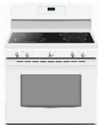
[Stove Glass Top]