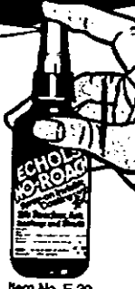
Item No. E-30

Use under sinks, between cabinets and appliances, in cracks and crevices, wherever you see roaches.