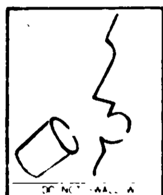
DO NOT SWALLOW