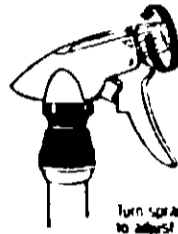
Turn sprayer tip to adjust spray

This product is designed for spot treatment in homes, apartments, and food areas of commercial and institutional buildings, food processing establishments, schools, day care centers, markets, restaurants, auto dealers, dog kennels, and other facilities. Do not use as a general spray. SHAKE WELL BEFORE USE.