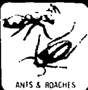
ANTS & ROACHES