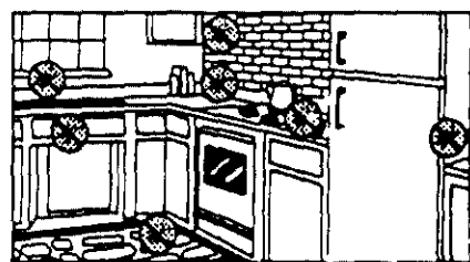
Suggested Tray Placement