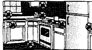
Suggested Tray Placement