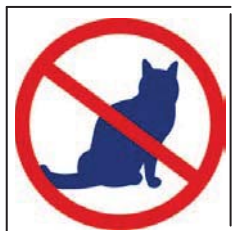
[1.5 x 1.5 cm icon]