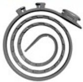
Proprietary Triple Clasp System