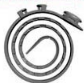
Proprietary Triple Clasp System