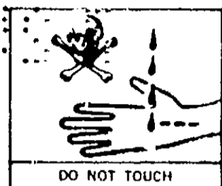
DO NOT TOUCH