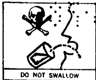
DO NOT SWALLOW