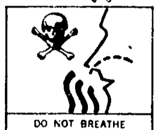
DO NOT BREATHE