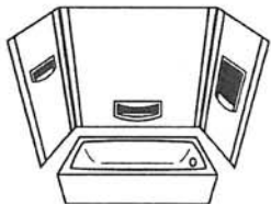
Tub and Shower walls