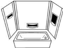
Tub and Shower walls