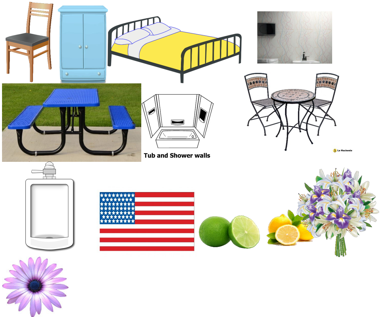
Tub and Shower walls