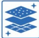
[ Multi-surface ]