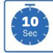
[ Kills SARS-COV-2 ] 6