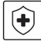
[ Hospital Disinfectant ]