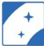
[ Streak-free ]