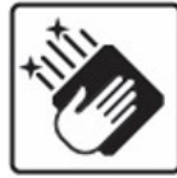
[ Wipe ]