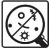
[ Antimicrobial ]

[Enter QR Code] (Note to reviewer: place holder for QR Code to link to Ecolab website)