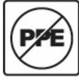
[ No PPE Required ]