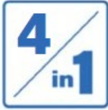
[Disinfectant] [Cleaner] [Streak-free] [Soft surface]