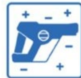
[ Electrostatic Sprayer ]