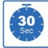
[ Kills Norovirus ] 6