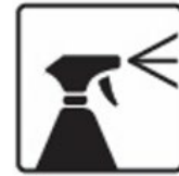
[ Spray ]