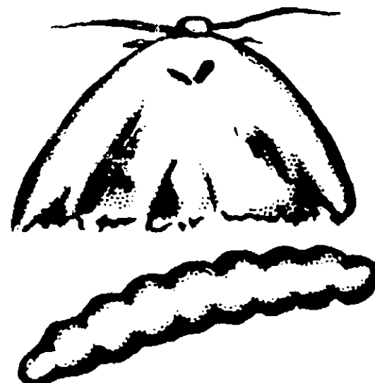
WEBBING CLOTHES MOTH AND LARVA