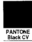
PANTONE Black CV

Use PANTONE MATCHING SYSTEM for accurate color representation.