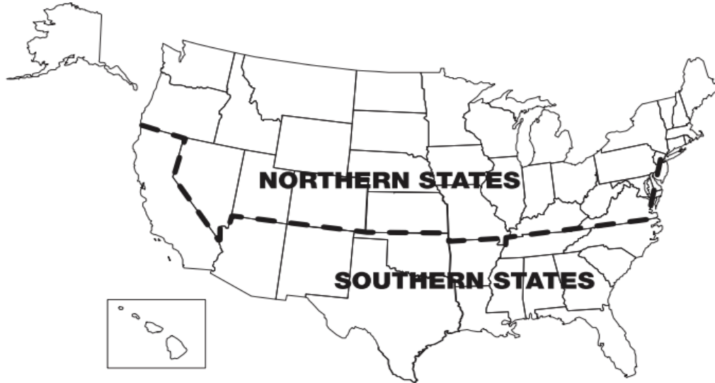
Use Area Regional Map for Rate Determination

In the growing season following application of Framework 3.3 EC to fruit and nut trees, plant only those crops for which Framework 3.3 EC is labeled for preplant incorporated treatment or crop injury may occur. DO NOT rotate to other crops (except for nut crops, fruit trees, or grapes) for 24 months following a Framework 3.3 EC application to fruit or nut trees.