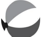
Representative image of a floatie: