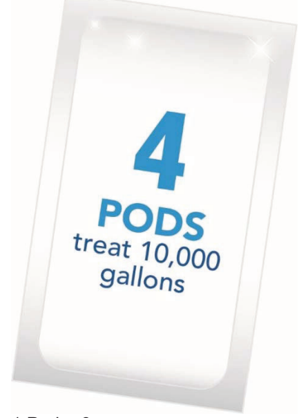
1 Pod = 6 oz.