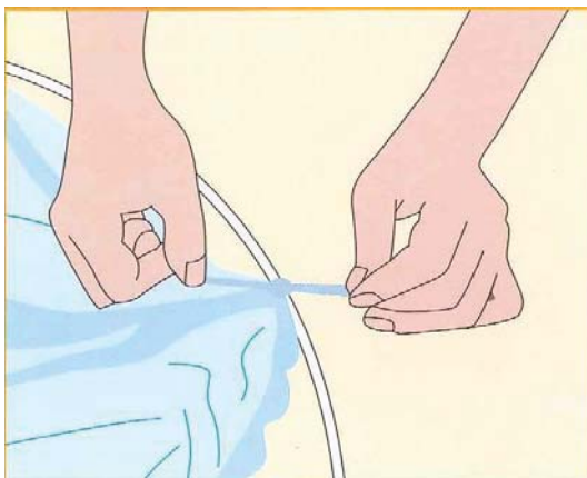
Unfold net and turn inside out to attach hoop to net. To set, tie all (six) strings securely to the ring.