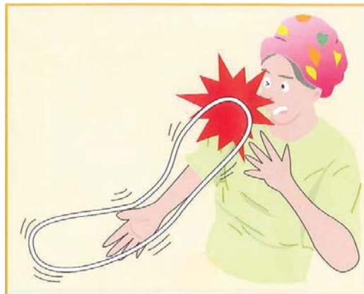
ATTENTION! RING MAY SNAP OPEN SUDDENLY. When unwinding the ring keep away; (a) from children (b) from face (eyes!)