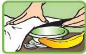
{graphic size 2.25 cm x 3.5 cm minimum}

OPEN cabinets, cupboards, drawers, closets and doors in area to be treated. REMOVE or cover exposed foods, dishes, utensils, food processing equipment and surfaces. Cover waxed wood floors, waxed furniture and other plastic surfaces near the fogger (newspaper may be used). CLOSE outside doors and windows. SHUT OFF fans and air conditioners.