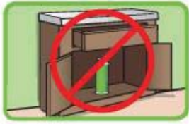
{graphic size 2.25 cm x 3.5 cm minimum}

DO NOT use in small, enclosed spaces such as closets, cabinets, or under counters or tables. Use of a fogger in an enclosed space may cause the product to explode, resulting in injury to people or damage to property. DO NOT use in a room 5 ft. x 5 ft. or smaller; instead allow fog to enter from other rooms.