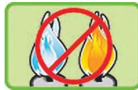
{graphic size 2.25 cm x 3.5 cm minimum}