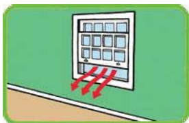
{graphic size 2.25 cm x 3.5 cm minimum}

Vacate the treated house, individual apartment unit, or other structure immediately. Do not remain in the area during treatment. Keep treated area closed for 2 hours. Do not re-enter for 2 hours. Before reoccupying the area, open all doors and windows and allow to air for 2 hours.