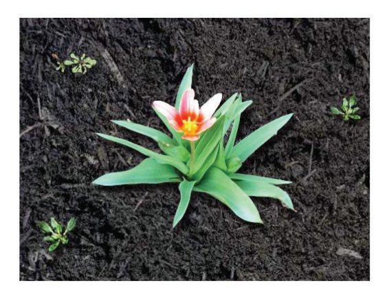
[Represents actual results] [Actual results may vary by weather]