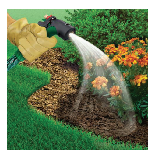
[4.] [Four] Water[PREEN WEED PREVENTER WITH SNAPSHOT] [product] [granules] into soil [or gravel]

[Reapply [PREEN WEED PREVENTER WITH SNAPSHOT] [product] every [6] [six] [months]