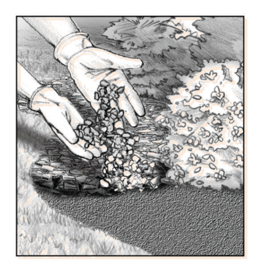
[2.] [Two] Apply [mulch] [or] [gravel]