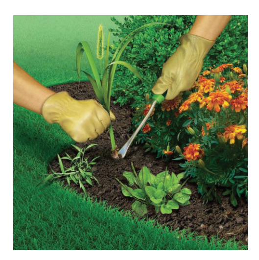
[1.] [One] Remove existing weeds