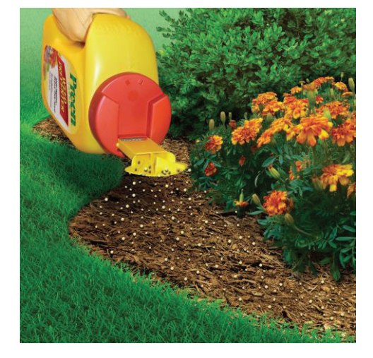
[3.] [Three] Sprinkle[PREEN WEED PREVENTER WITH SNAPSHOT] [product][granules] evenly