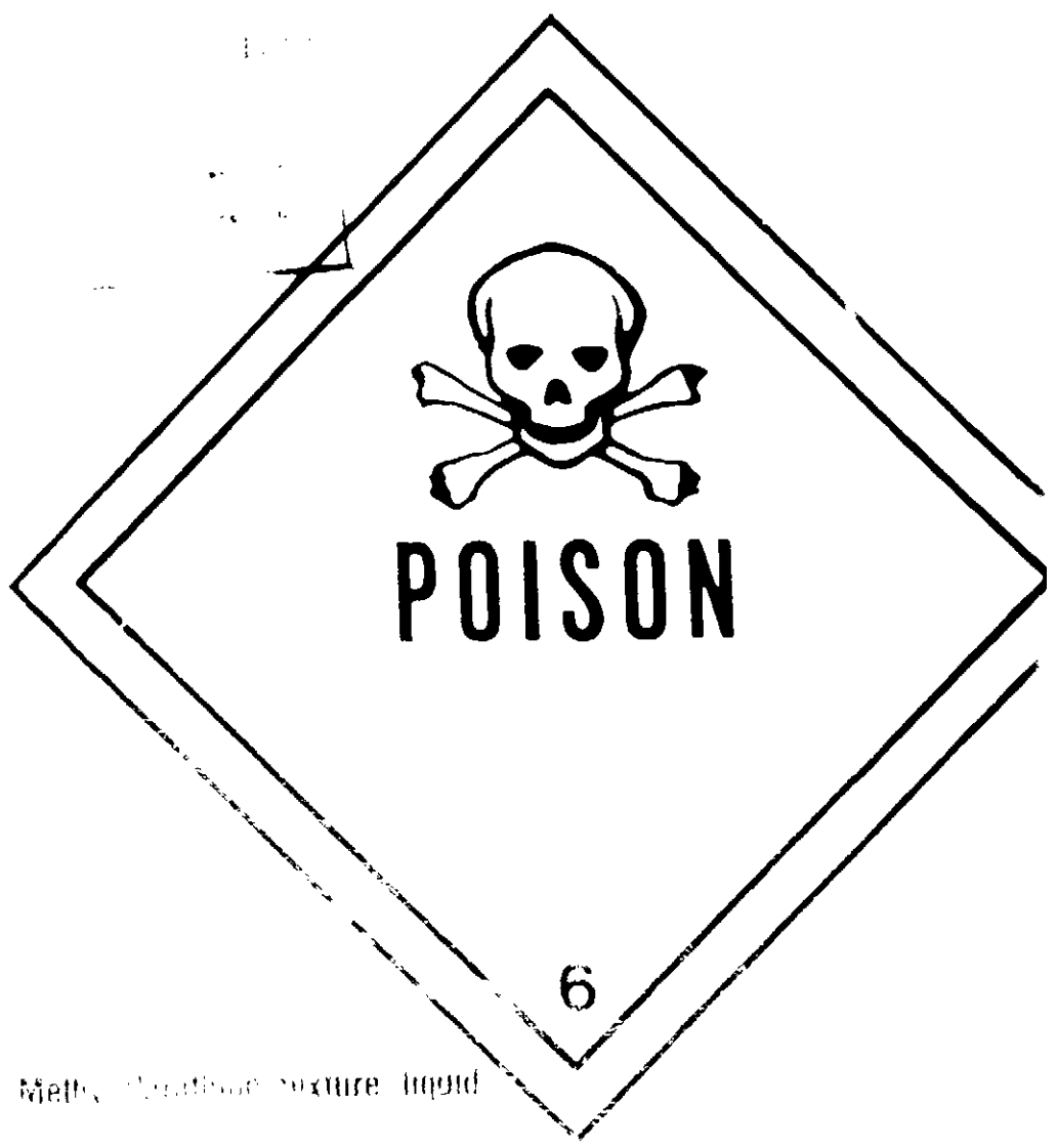
Methyl cyanide mixture liquid

When a person has been poisoned, the following information should be given to the physician: 1. Name of the poison 2. Amount of the poison 3. Time of poisoning 4. Signs and symptoms 5. First aid treatment given 6. Name of the person 7. Address of the person 8. Name of the physician 9. Name of the hospital 10. Name of the doctor 11. Name of the nurse 12. Name of the pharmacist 13. Name of the chemist 14. Name of the druggist 15. Name of the dealer