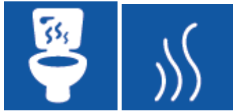
(Deodorizes) (To) Save your nose