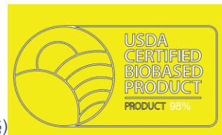
(§) (§) << This graphic is white lettering and white graphics >>

(§)This mark is not an indication of safety. Read and follow all label instructions. << This disclaimer must be on pack when the BioPreferred logo is in use.>>