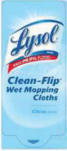
The image in context of the label/package (to help consumers know where to peel open the package)

Above image is to help consumers know where to peel open the label/package to remove a cloth.