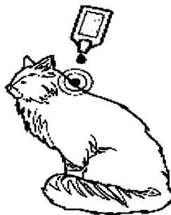
Image for cats over (greater than) (>) 9 lb (4 kg) (1.03 mL size only)

Step 1. Hold applicator (tube) in upright position away from your face and snap tip open by bending it and folding it back on itself.