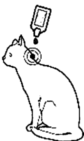
Image for cats and kittens 4.4 to 9 lb (2 to 4 kg) and 8 weeks of age or older (0.51 mL size only)