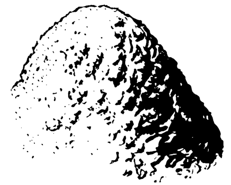
FIRE AN MOUND