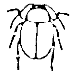
POTATO FLEA BEETLES