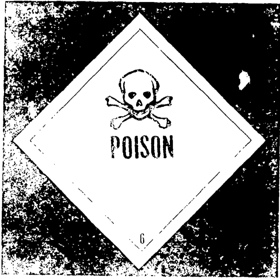
METHYL PARATHION LIQUID 442783 RQ

Keep containers tightly closed when not in use. Store in a cool, dry place. Do not use if the container is damaged or leaking. Dispose of empty containers according to local regulations.