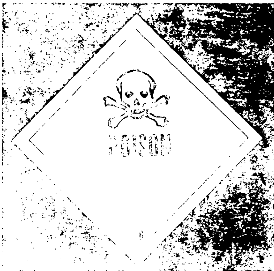
POISON HAZARD SIGN