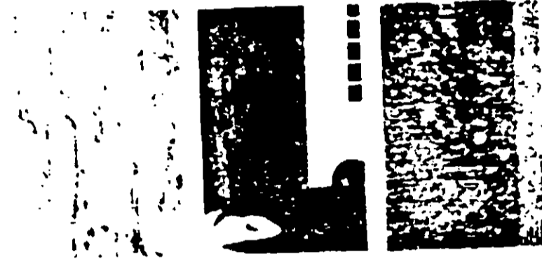
Wood dipped in Cuprinol resists rot.