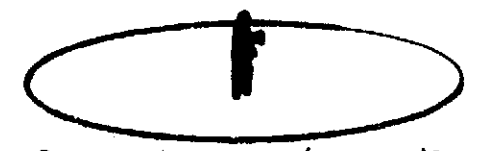
On calm days, spray from center

Directions: Shake before using. Point nozzle away from face. For best results spray when air is calm or breeze is slight.