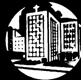
HOSPITALS — THEATRES