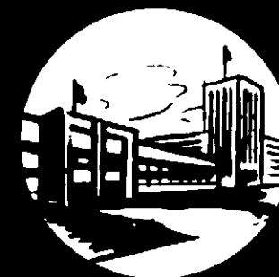
INSTITUTIONS — SCHOOLS