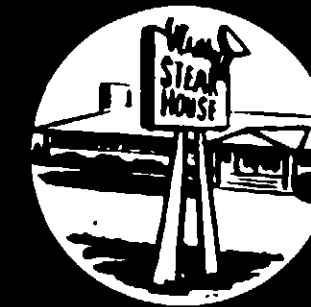
LOUNGES — RESTAURANTS