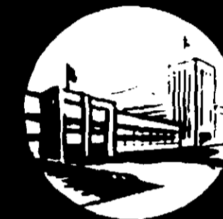
INSTITUTIONS - SCHOOLS