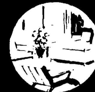
OFFICES - HOMES

FOR THE HOME, OFFICE, SCHOOL, INSTITUTION, FACTORY, THEATRE, RESTAURANT AND ALL OTHER PLACES WHERE PEOPLE GATHER.