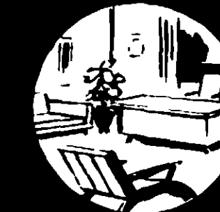
OFFICES - HOMES

FOR THE HOME, OFFICE, SCHOOL, INSTITUTION, FACTORY, THEATRE, RESTAURANT AND ALL OTHER PLACES WHERE PEOPLE GATHER.