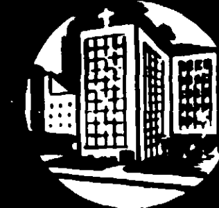
HOSPITALS - THEATRES