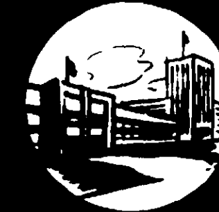
INSTITUTIONS - SCHOOLS