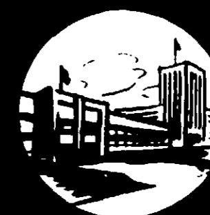
INSTITUTIONS — SCHOOLS