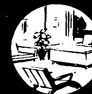
OFFICES — HOMES

WARNING: KEEP OUT OF REACH OF CHILDREN CONTENTS UNDER PRESSURE SEE BACK PANEL FOR FURTHER CAUTIONS.