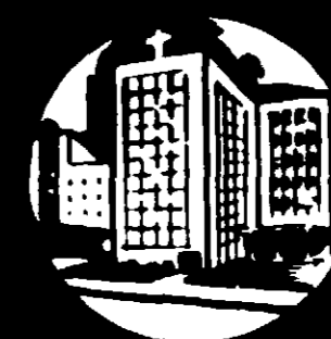
HOSPITALS — THEATRES