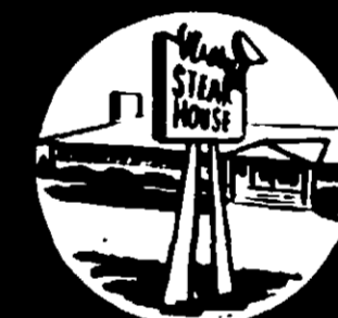
LOUNGES - RESTAURANTS