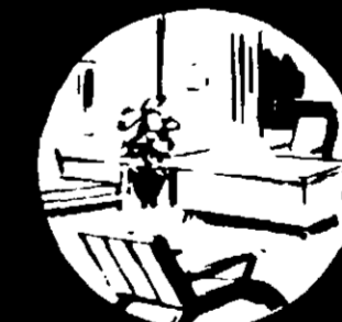
OFFICES - HOMES

WARNING: KEEP OUT OF REACH OF CHILDREN CONTENTS UNDER PRESSURE SEE BACK PANEL FOR FURTHER PRECAUTIONS