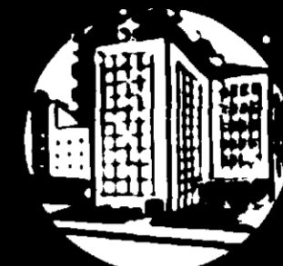
HOSPITALS - THEATRES

CONTENTS UNDER PRESSURE: Do not puncture or incinerate container. Do not expose to heat or store at temperatures above 120° F. Do not use near fire, sparks or flame.